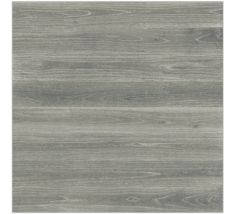
RIGA DARK GREY