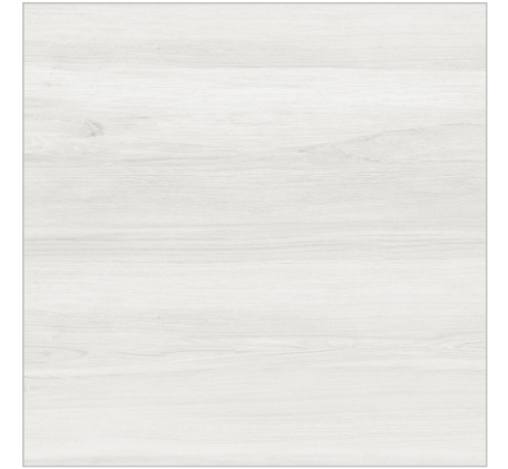
FOREST LIGHT GREY